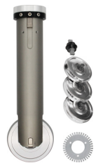
Creasing Wheel Tool